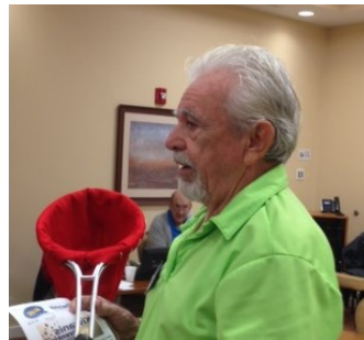
It appears that our Sheriff has obtained a church collection pouch to collect his booty!